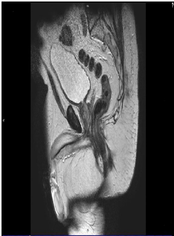
Figure 1 T2-weighted magnetic resonance image showing an anteverted coccyx and rectal impingement.