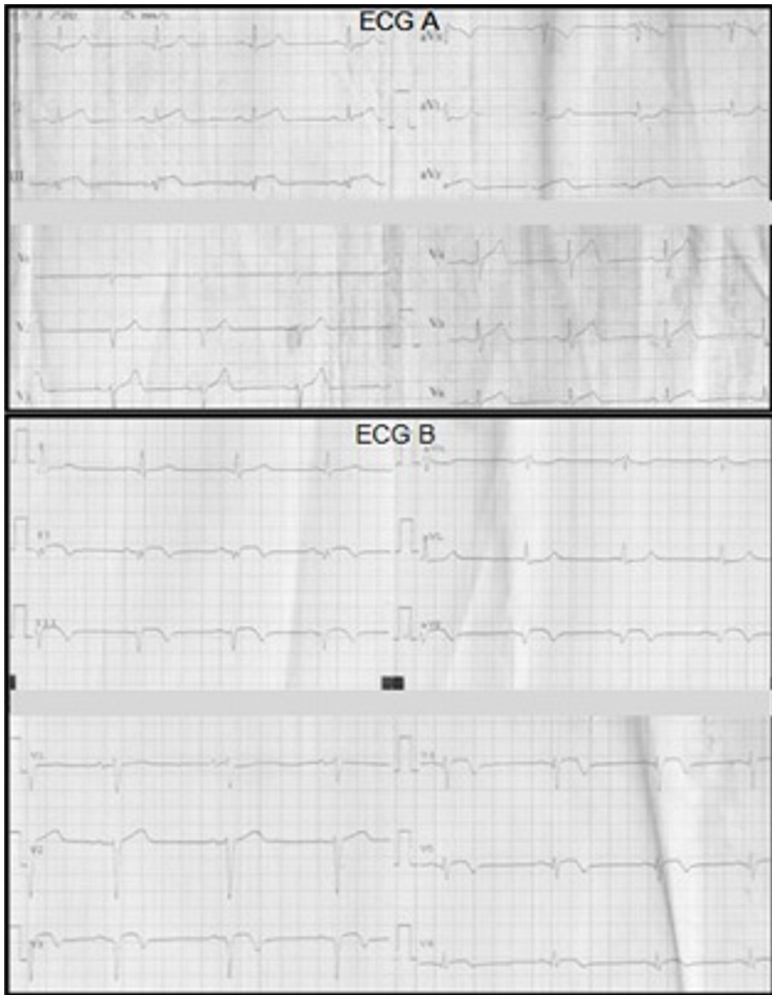
Figure 1 ECG findings. (A) Electrocardiogram on admission. ST-segment elevation in DIII, aVF and ST- segment depression in DI, aVL. (B) Electrocardiogram on the seventh day. Q wave in inferior leads and apicolateral subepicardial ischemia.

(242,000/mm 3 ) and bleeding time (140 seconds) were normal. A transthoracic echocardiography estimated his left ventricular ejection fraction at 61% without evidence of segmental motion abnormalities. A coronary