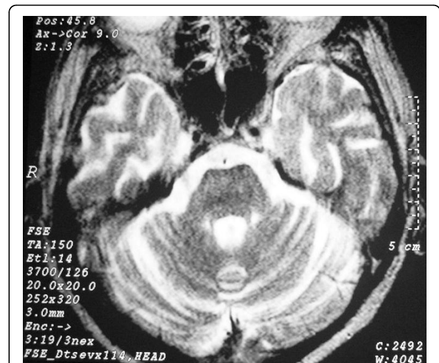
Figure 4 Brain axial T2W magnetic resonance imaging at the level of the pons. Widening of cerebellar sulci.

alkaline phosphatase; and blood coagulation. The results of serologies for HIV, hepatitis B and C were negative.