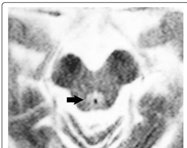
Figure 3 Brain axial T2W magnetic resonance imaging at the level of the midbrain. High signal around the Aqueduct of Sylvius (arrow).

102 mg/dL (NR <50 mg/dL); albumine = 2.9 mg/dL (NR = 3.4-4.8 g/dL); triglycerides = 86 mg/dl (NR <150 mg/dL); low-density lipoprotein = 76 mg/dL (NR <100 mg/dL); high-density lipoprotein = 17 mg/dL (NR >40 mg/dL); magnesium = 0.47 mg/dL (NR = 1.3-2.1 mEq/L); and phosphorus = 2.3 mg/dL (NR = 2.7-4.5 mg/dL). The results of the following tests were found to be within the limits of normality: sodium; potassium; creatinine; glucose; amylase; lipase; alanine and aspartate aminotransferase; gamma-glutamyl transpeptidase;