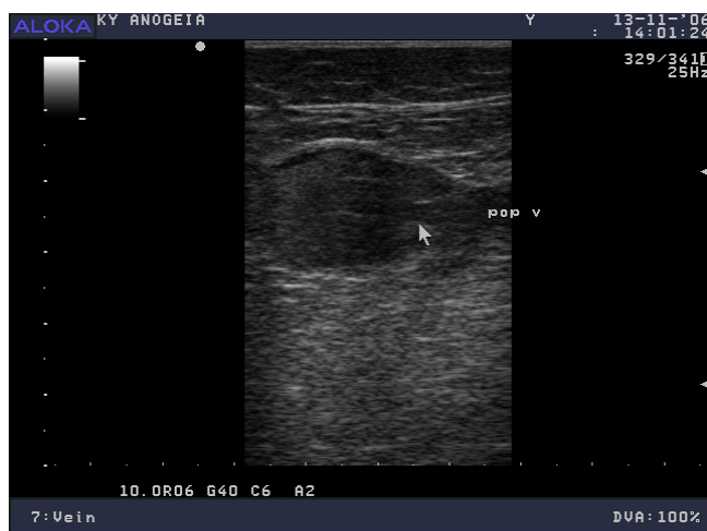
Figure 1 Distal right popliteal vein, B-mode ultrasonogram, transverse axis. The vein lumen could be obliterated using a small amount of extrinsic pressure.

Popliteal venous aneurysm can lead to severe complications including deep vein thrombosis, pulmonary emboli and death [7,8]. It was first described as an uncommon cause of pulmonary embolism 30 years ago [2]. Asymptomatic incidental detection, local lower extremity symptoms or embolic pulmonary episodes may represent different aspects of presentation of the same condition [1]. Most cases present as episodes of pulmonary embo-