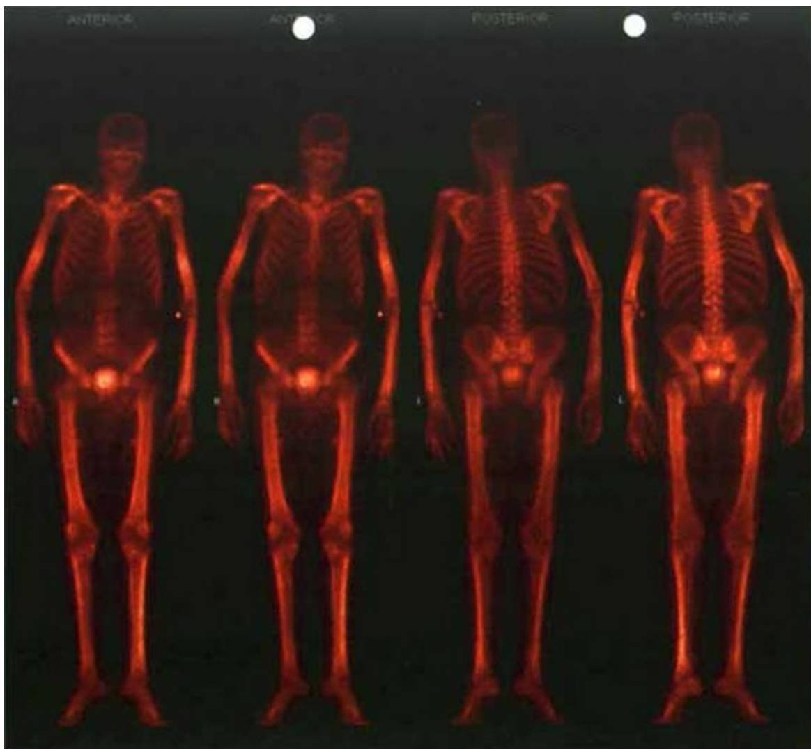
Figure 1 Skeletal scintigraphy showing diffusely increased uptake and the absent kidney sign (a super scan).

50%. It has a false negative rate of 1–5%, mostly being due to a super scan [1]. When caused by prostate cancer, super scans are found exclusively in histologically high-grade forms.